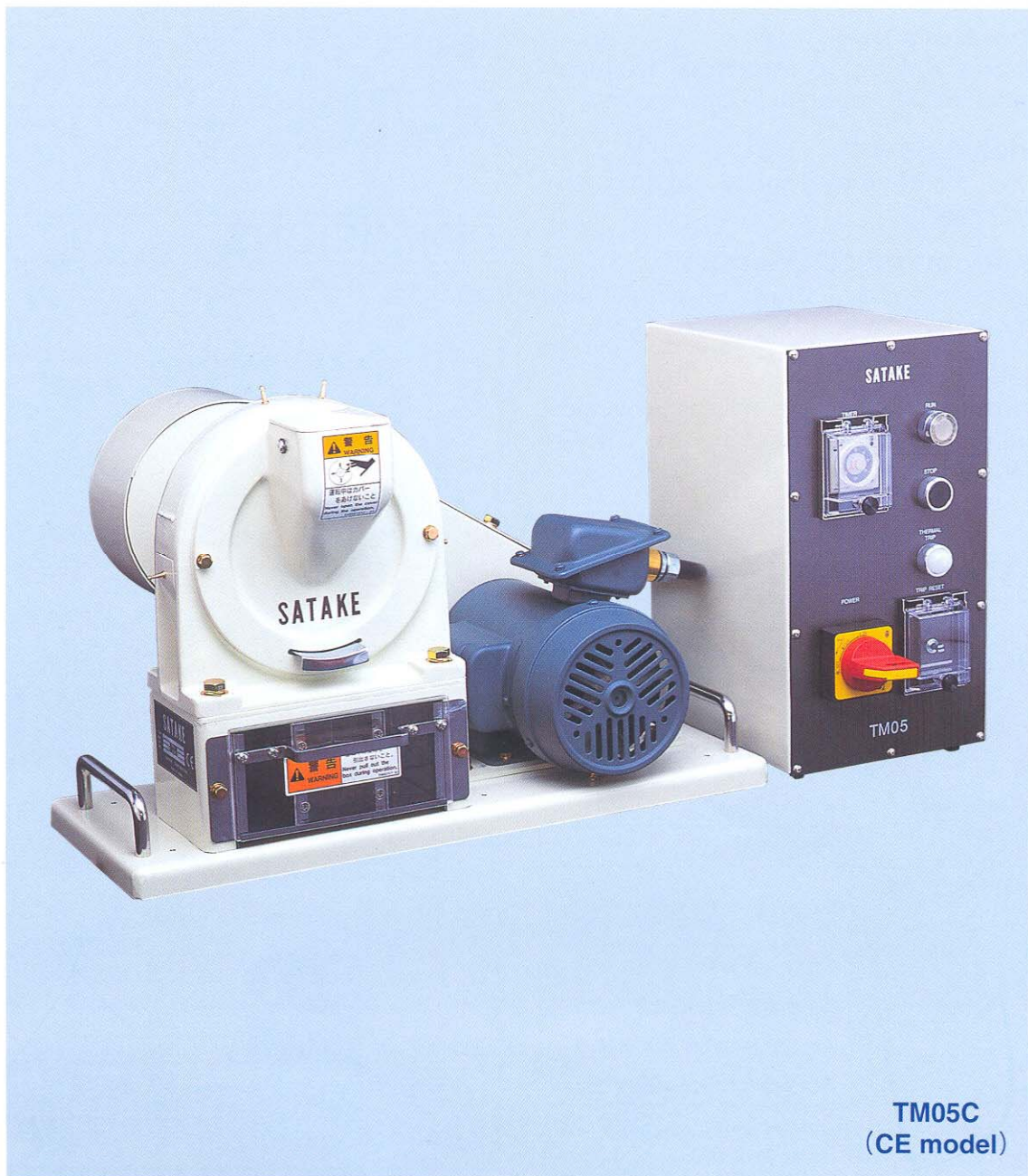
TM05C (CE model)

FOREMOST IN THE GRAIN WORLD SATAKE CORPORATION