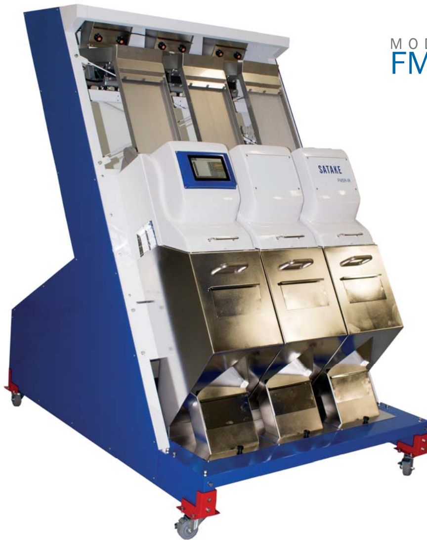
MODEL FMSR-IR (3 chutes)

The FMSR-IR is an efficient midsize sorter that features Full Color RGB + Shape + Infrared technology. It is ideal for sorting products such as dry beans, corn, nuts, coffee, seeds, plastics and multiple varieties of grain as well. The FMSR-IR features patent-pending Satake software assuring quick set-up and hassle-free operation. Behind every optical sorter is the assurance of Satake's premiere after the sales support and customer service.